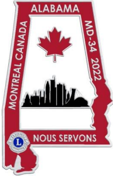
2022 State Pin