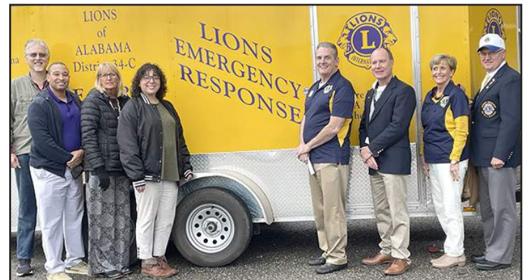
Bay Minette Lions Club with Disaster Relief trailer