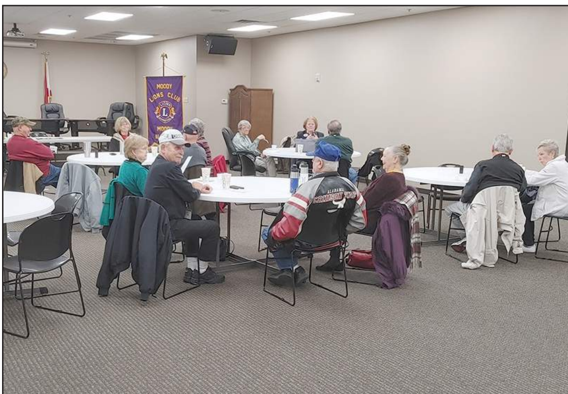
Moody Lions Club