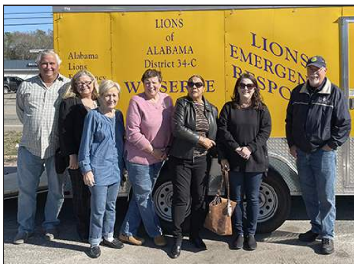
Citronelle Lions Club with Disaster Relief trailer