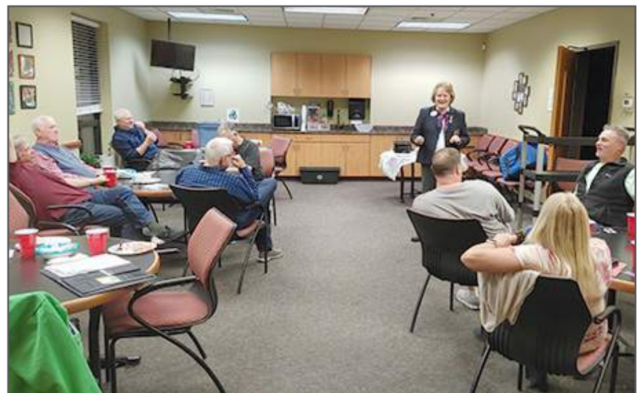
West Homewood Lion Club