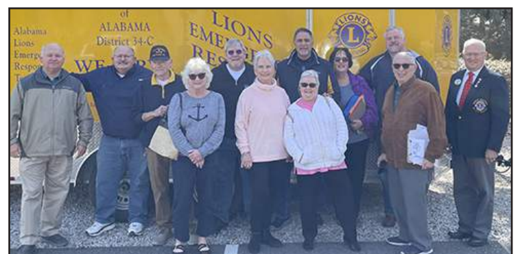
Gulf Shores Lions Club with Disaster Relief trailer