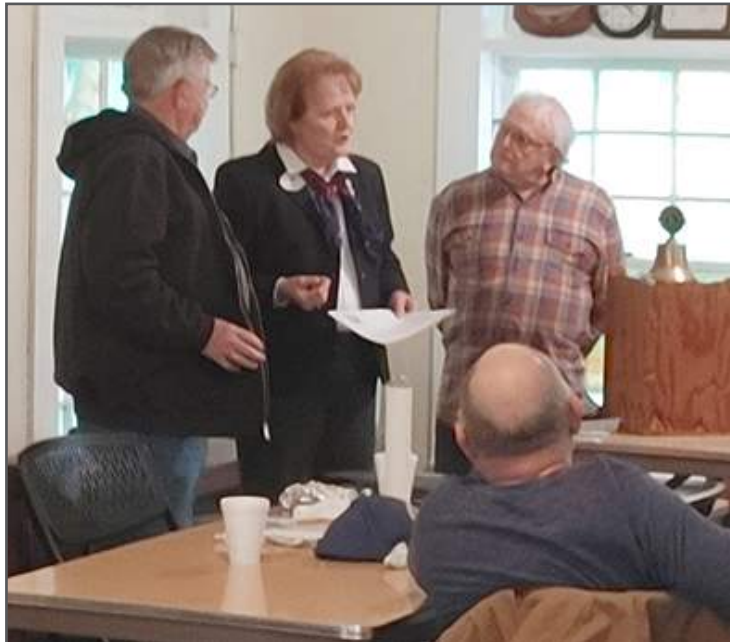
Oakman Lion Club