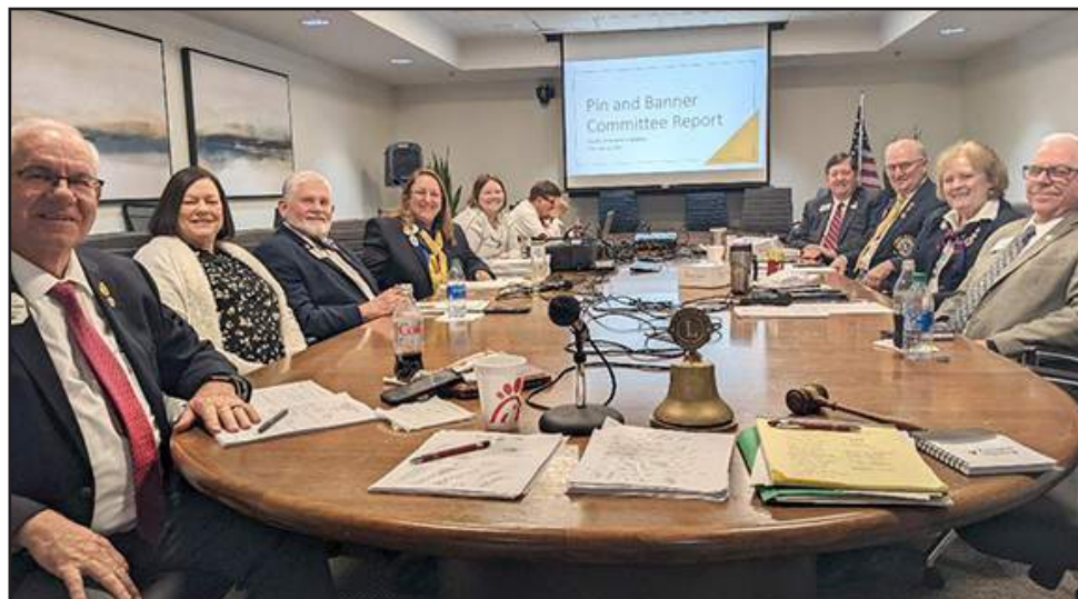
Lions Club - Council of Governors Meeting

NON-PROFIT ORGANIZATION U.S. POSTAGE PAID PERMIT #432 MONTGOMERY, AL