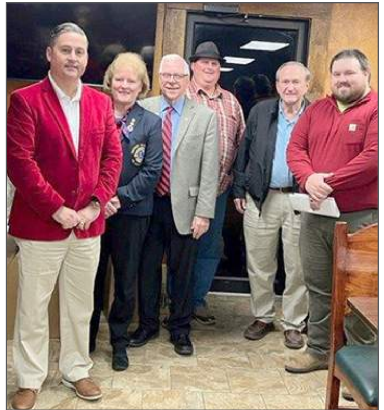
Fayette Lion Club