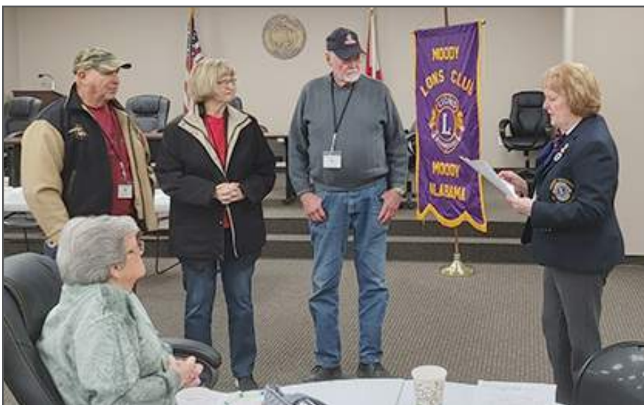
Moody Lion Club