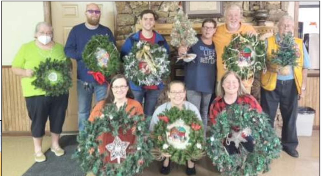
Above, Guntersville Lions make wreaths to donate to the Barfield Nursing Home, spreading Christmas cheer!