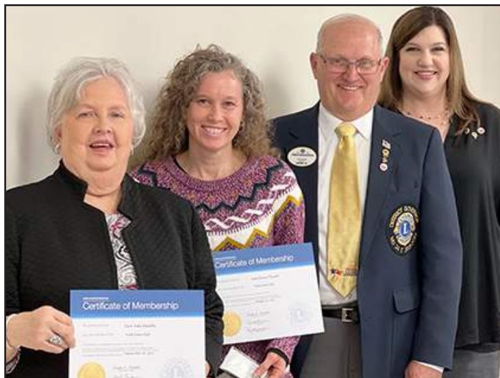
York Lion Club newest members