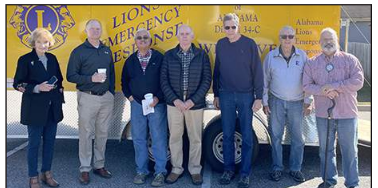
Enterprise Lions Club with Disaster Relief trailer