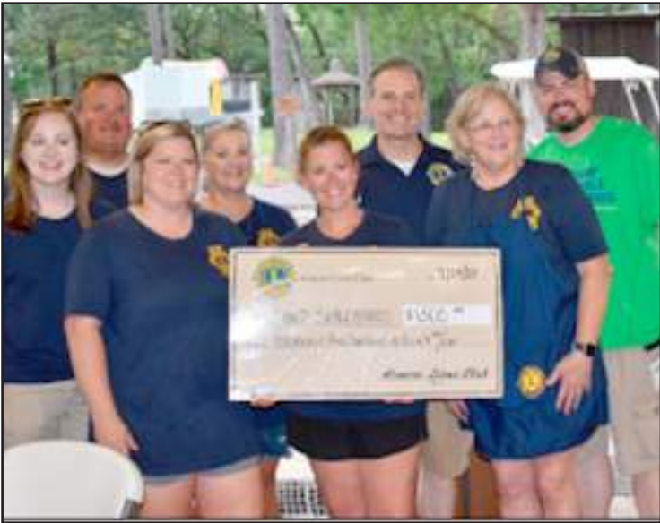
Atmore Lion's Club generously donated dinner to Coastal Camp and presented a check to sponsor camp! Thank you, Atmore Lion's Club!