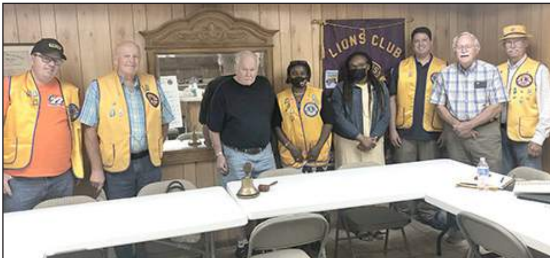
Grove Hill Lions Club

Until next time, CONNECT and let's serve our communities.