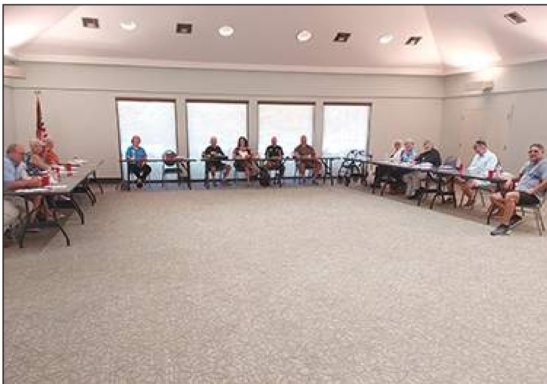
Gulf Shores Lions Club

You will see some photos of the opportunities I have in traveling and reporting about ALS. It is service from the heart!