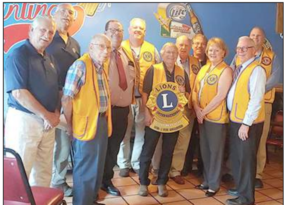
Greensboro Lions Club