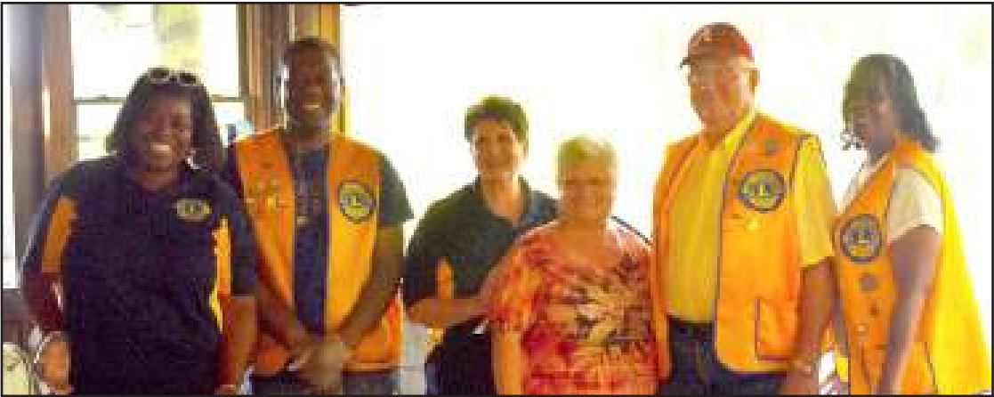
Saraland Lions Club provided food at Coastal Camp! Thank you, Saraland Lion's Club!