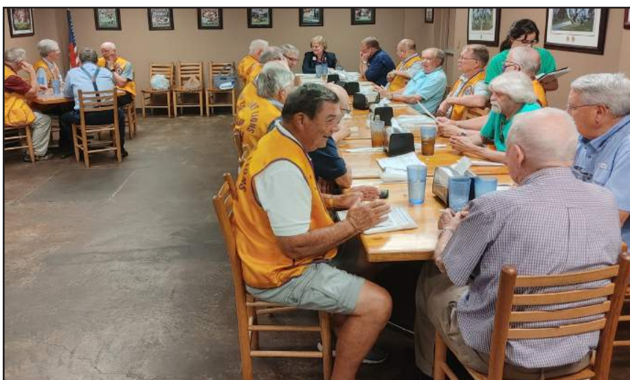
Northport Lions Club