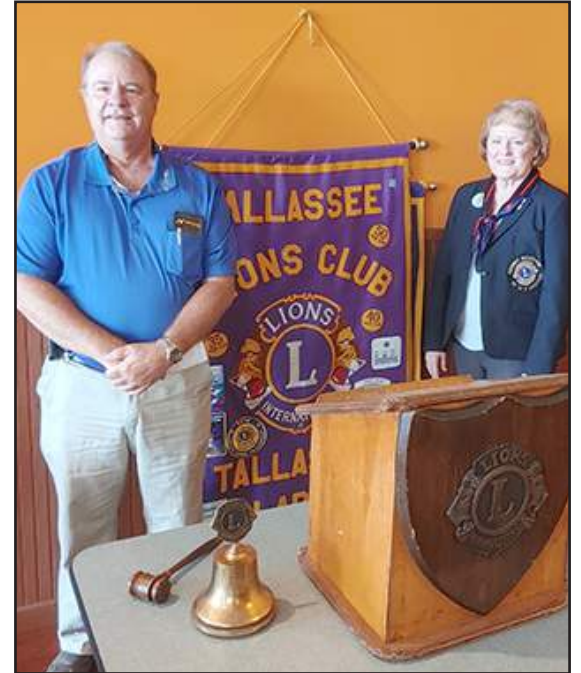
Tallassee Lions Club

For the remainder of August and September, I'm looking forward to visiting more clubs, USA/Canada Forum in Des Moines, Iowa, and of course our next District B's Cabinet Meeting on October 2 at the Lion's Den in Adamsville at my home club of Adamsville-Forestdale!