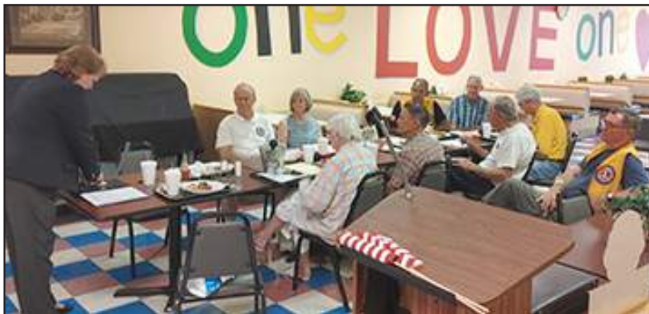
Opelika Lions Club