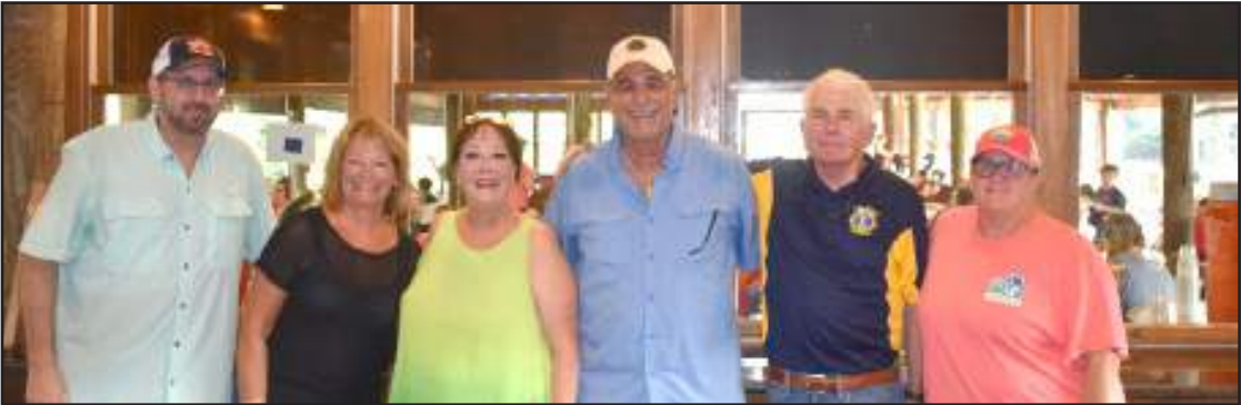
Gulf Shores Lions Club provided dinner at Coastal Camp! Thank you, Gulf Shores Lion's Club!