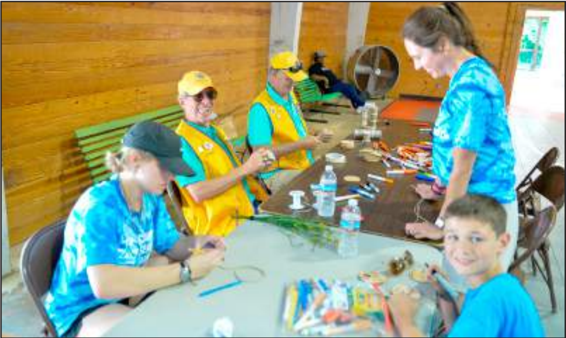
Auburn Lion's Club volunteered at Lake Martin by handing out name tags, directing traffic, and so much more. Thank you, Auburn Lions!