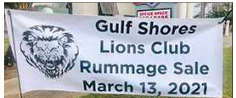
Gulf Shores Club holds a Rummage Sale