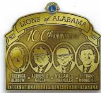
2021 Prestige Pin