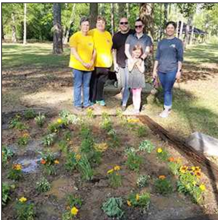
Flomaton Club builds a Pollinating Garden

"Houston, the ship is secure, this is Apollo 13 signing off".