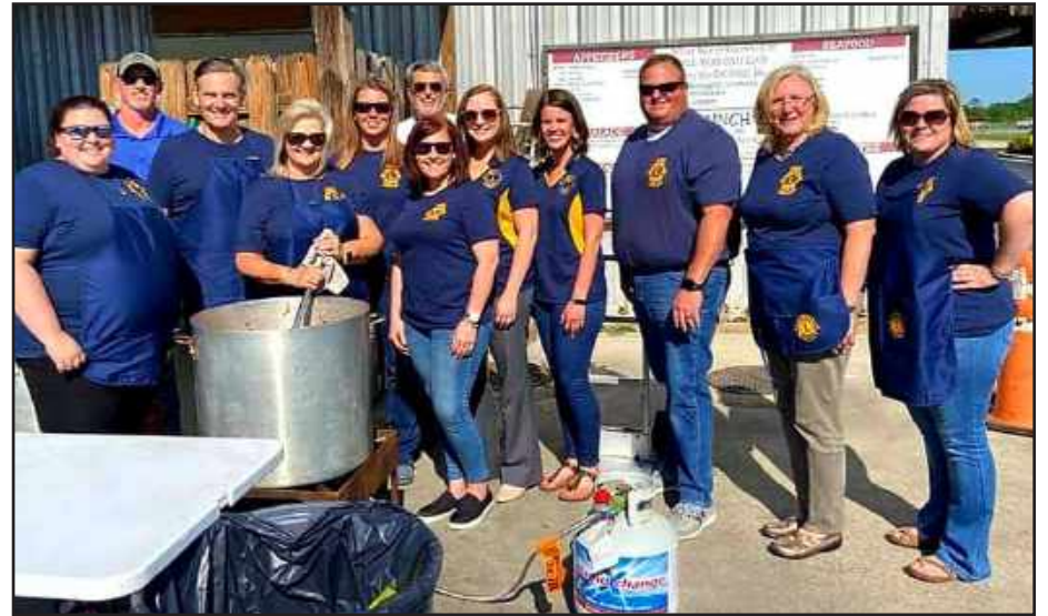
Atmore Club holds a Spaghetti Dinner Fundraiser for St. Jude Hospital.

The Multi District came through with a Membership Growth Grant to help with recruiting new members. Headland and Fairhope have already scheduled their Membership