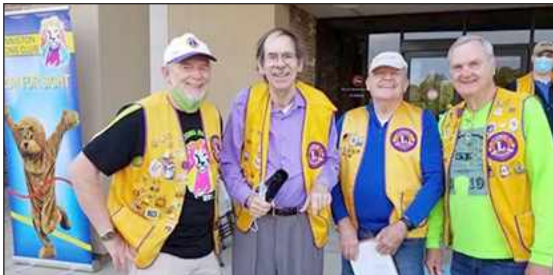
Anniston Run for Sight-Another successful 5K fundraiser for Anniston Lions Club! They had 125+ runners. This was their 23rd annual race! They raised $9,000 from the run and this will help meet the needs of many people in their community that cannot afford eye exam and glasses.