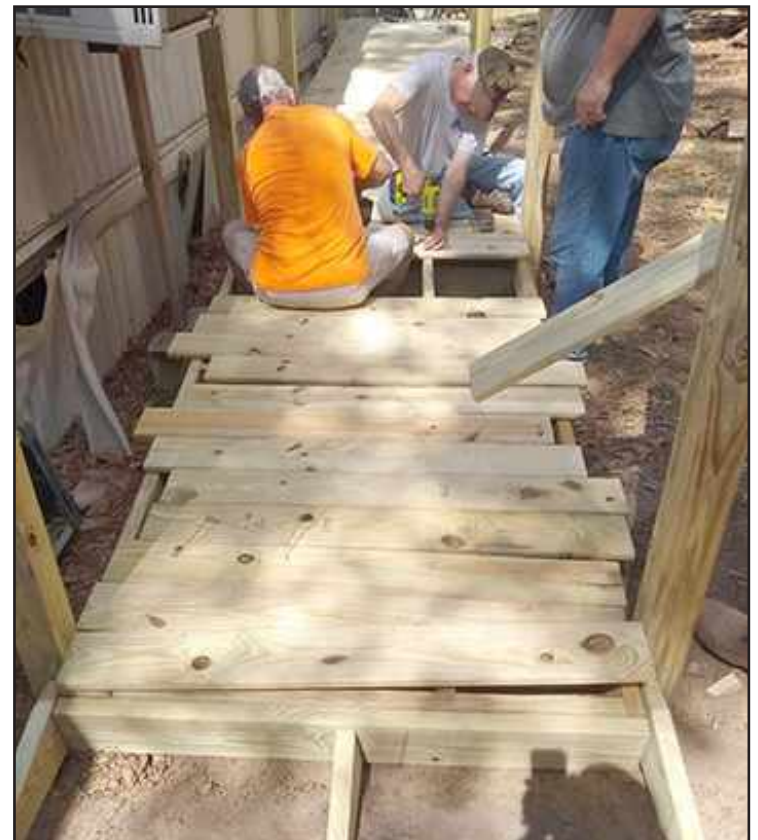
Headland Club build a handicap ramp

Send form and payment to: PCC Ron Seybold 40 County Road 1176 Cullman, AL 35057