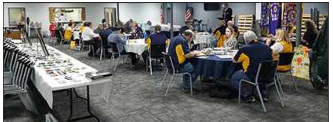
Saraland Club celebrates its 65th anniversary as a club.