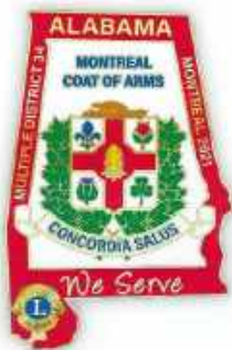
2021 State Pin