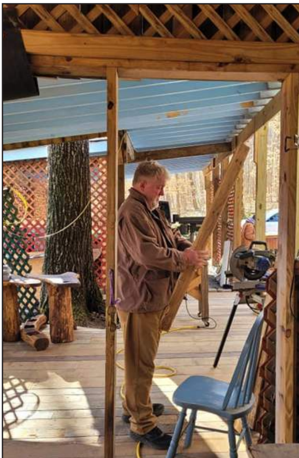
Guntersville Lions Club - helping an elderly family in our area - building a rail around their porch.