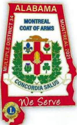
2021 State Pin

As we move forward, please reach out to your District Governor Team and pledge your support to reach the district goals, as established by the Lions of your district at the Build a Vision meeting. Your Global Leadership team is committed to providing the tools to equip, educate and empower Lion leaders to service more effectively.