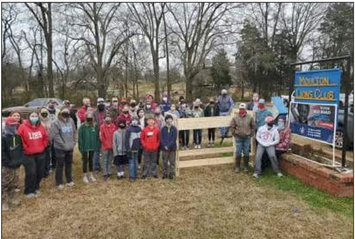
Moulton Lions partnered with Sleep in Heavenly Peace to build 75 beds for local children who had previously slept on the floor.