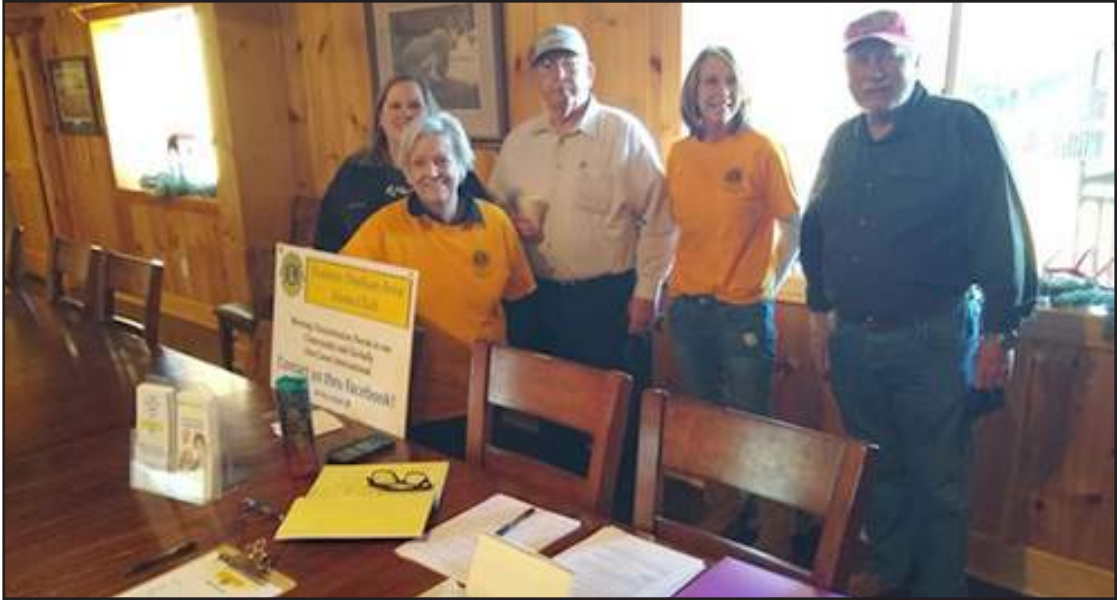
Pictured, above, "Shoot with Lions" by the Greater Dothan Lions Club.