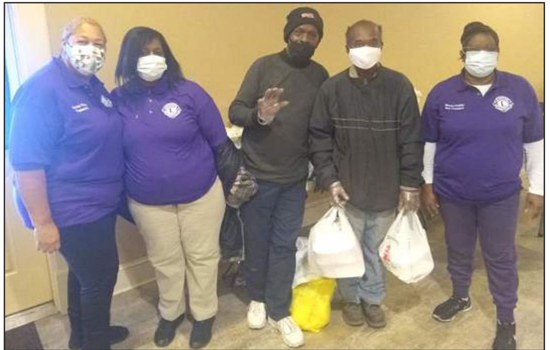
Ozark Lions Club feeds the hungry.