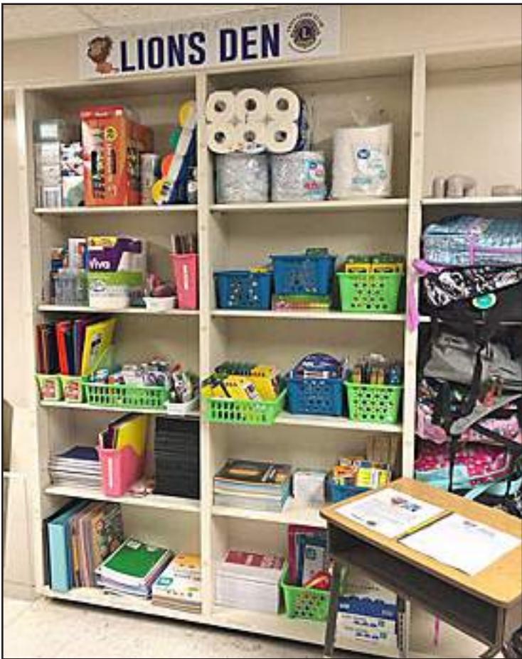
Lions Den Resource Closet for teachers supplied by the Troy Lions Club.