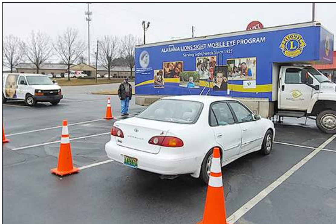
MEC giving eye exams and glasses

Lions, I am so thankful to be a part of the service you are providing to the people in Alabama in vision care!