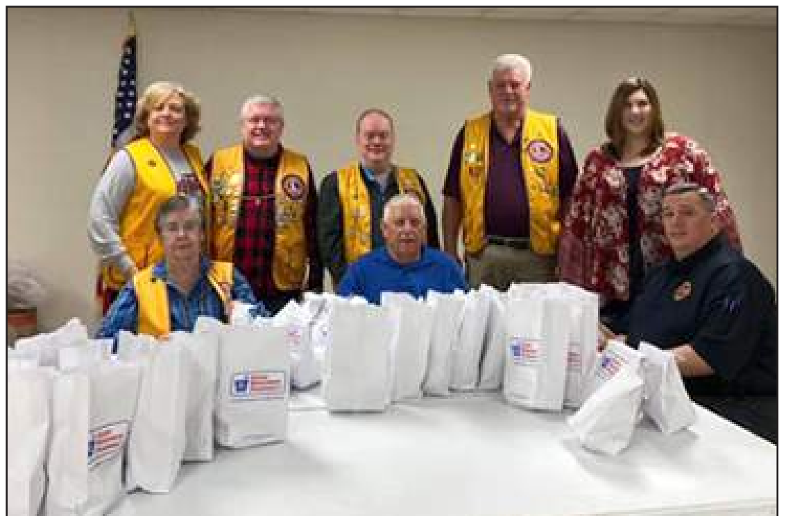
York Lions Club prepared Fruit Bags for Residents of Sumter Health & Rehab.