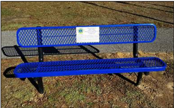
Pictured, at left, bench installed by the Saraland Lions Club to honor deceased member who were part of the military.