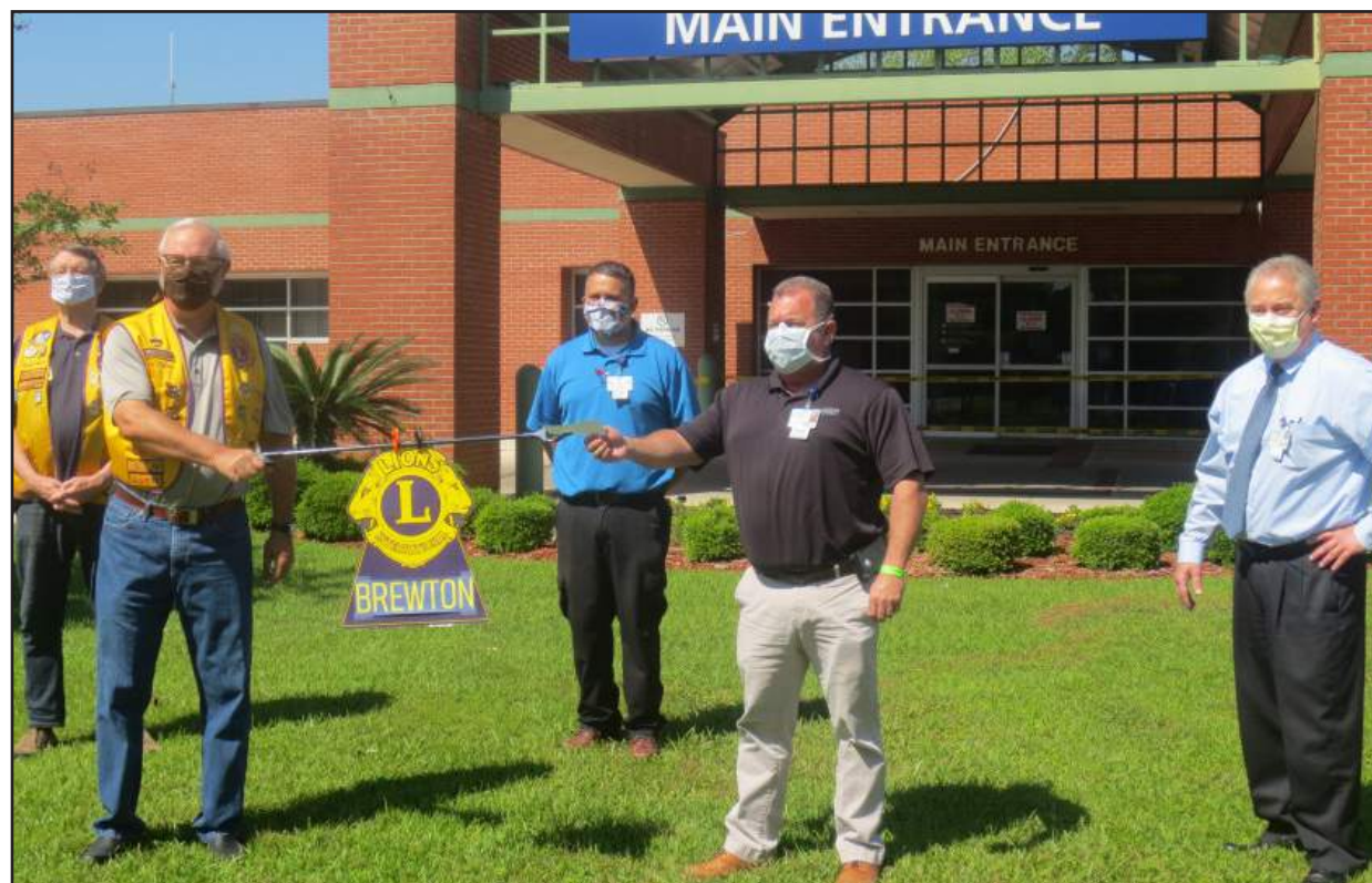
Brewton Lions Club at the D.W. McMillan Memorial Hospital