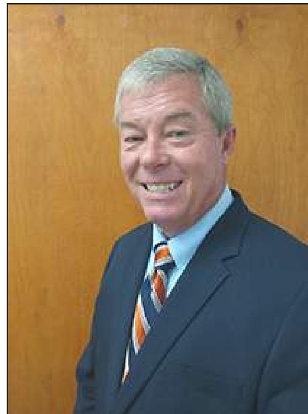
District Governor Elect Pete Crews