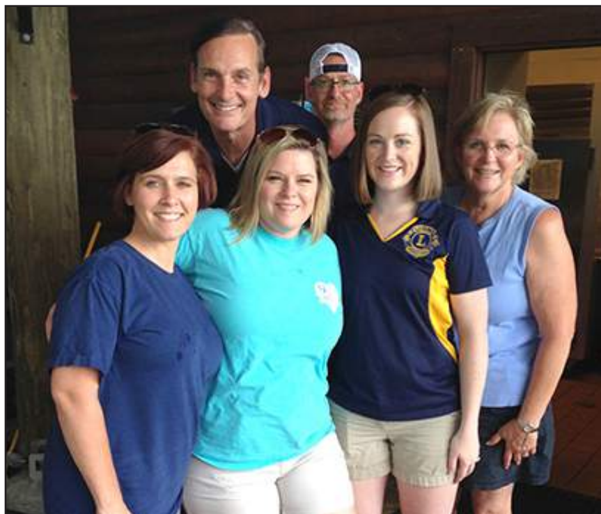
Atmore Lions at Coastal Camp Seale Harris