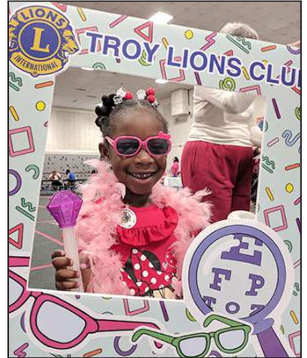
Pictured, above and below, Troy Lions Club vision screening

On August 10, 2019, the annual MD Lions Leadership Conference, TIPP Conference, was held. The agenda was filled with informative, essential and relevant courses. It was well attended with 124 taking advantage of the conference, a wonderful turnout. Sixty-five Lions from District C attended. Many thanks to the Montgomery Lions and the Pike Road Lions for all your help with registration, we could not have