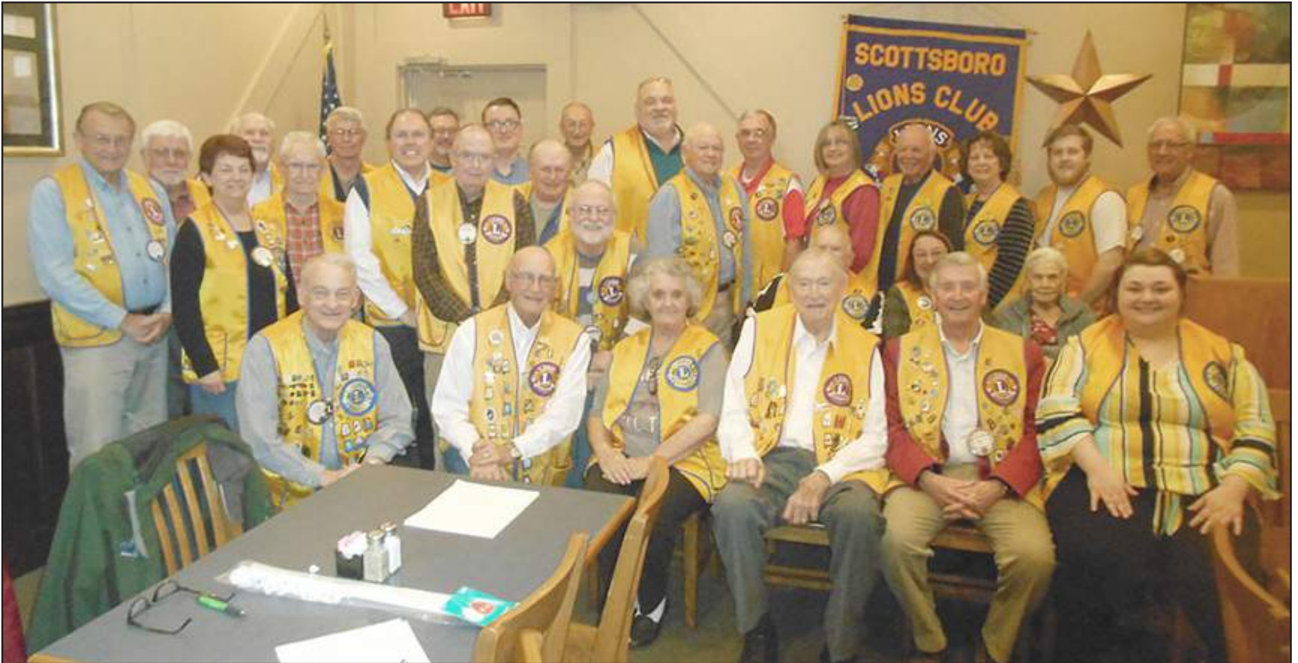
Recently the Scottsboro Lions gathered at a regular club meeting to hear about the Clubs participation in a project to promote membership throughout the Lions Clubs in the United States. The Scottsboro Lions Club is the center of a multifaceted distribution of eyeglasses that enhance the vision of thousands of people throughout the world. Unclaimed Baggage works with the Scottsboro Lions in providing a majority of the eyeglasses which are distributed annually (close to 100,000 pair). The ARC of Jackson County assists the Lions in processing these eyeglasses. The Lions also provide eye exams (done by local Optometrists) and glasses to about 60 people annually in Jackson County. Eye screening also is done in the local schools. Although there are other efforts that the Lions are involved in (i.e., Christmas Charities, youth leadership, diabetes, etc.) eyesight efforts are a principal focus.