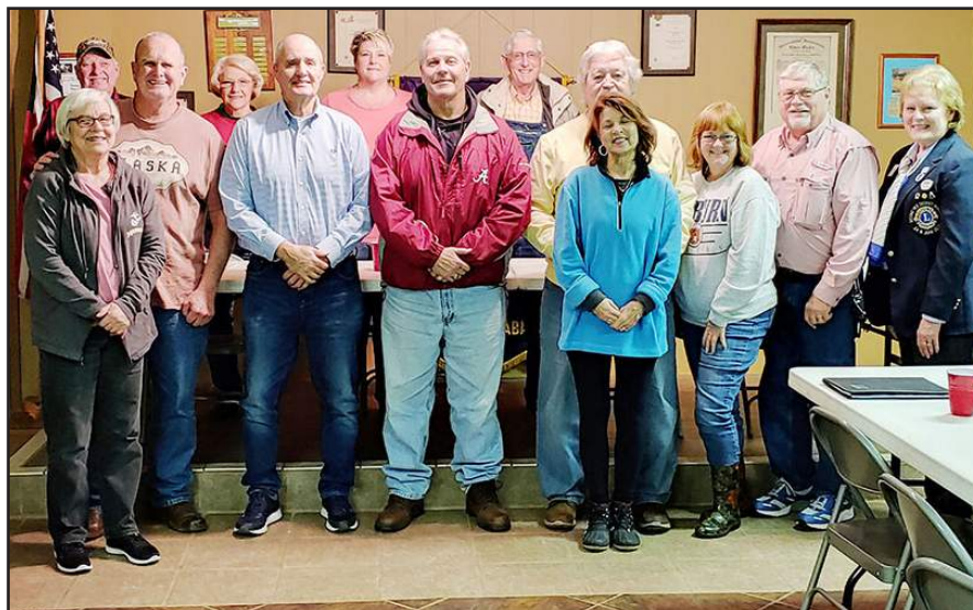
Visiting with the Northside Lions Club

Adults 1,080 Referrals 501 Percentage 46% Children 11,112 Referrals 1,571 Percentage 14%