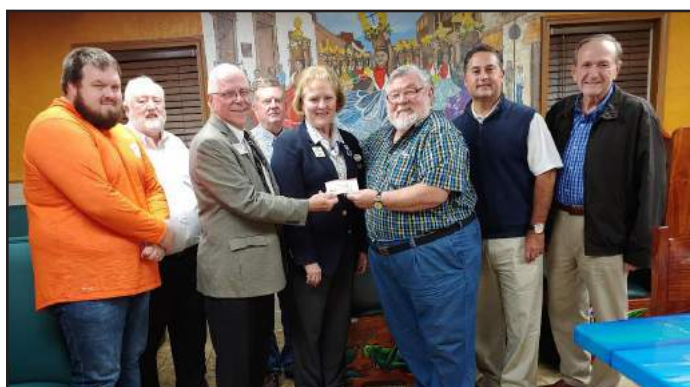
Fayette Lions Club