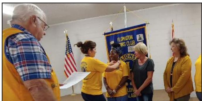
Flomaton Lions Club