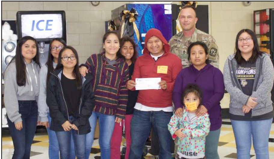
Fort Payne High School Leo's presenting a check for $1000 to a family in the area that lost their home due to fire.