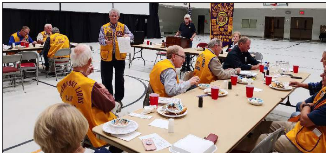
Northport Lions Club

A sincere Thank You to Our Corporate Sponsors, Estates, Foundations and Lions