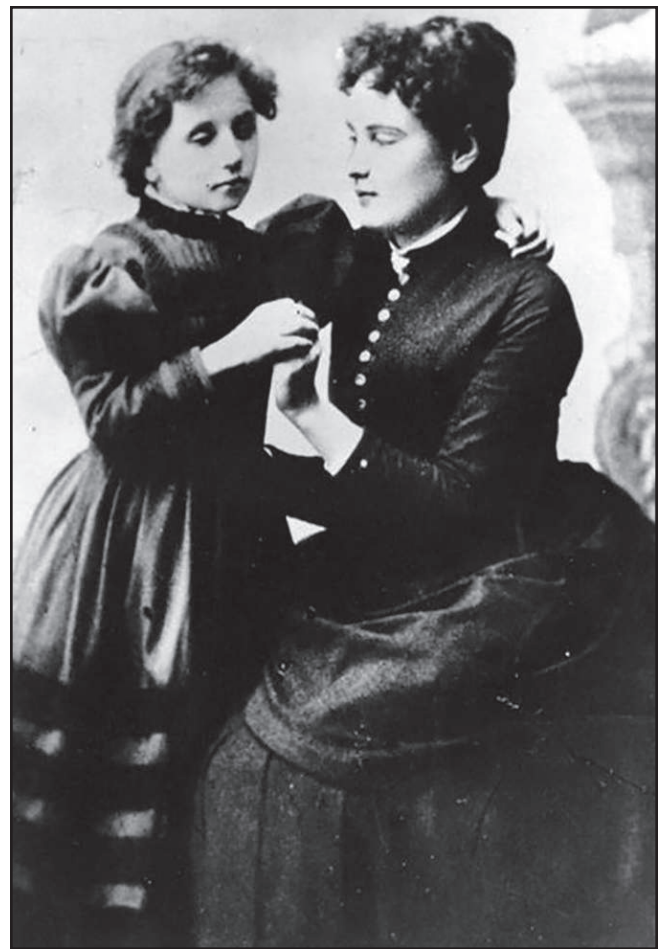
In 1887, Anne Sullivan arrived at the Tuscumbia, Alabama, home of Captain and Mrs. Arthur H. Keller to become the teacher for their deaf and blind 6-year-old daughter, Helen.

Anne later wrote: "She had chosen the prettiest gift and the one which had pleased her most to give a little stranger." That night, the excited Helen hung two stockings, just in