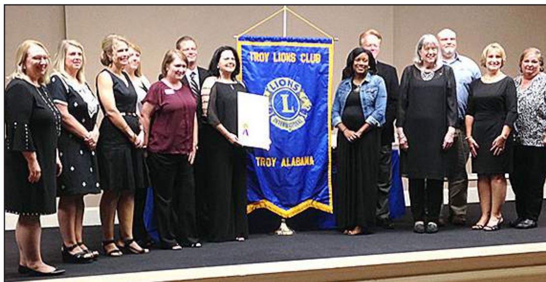
Troy Club at Charter Night