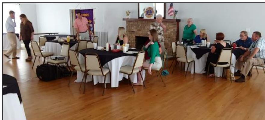
Atmore Lions Club