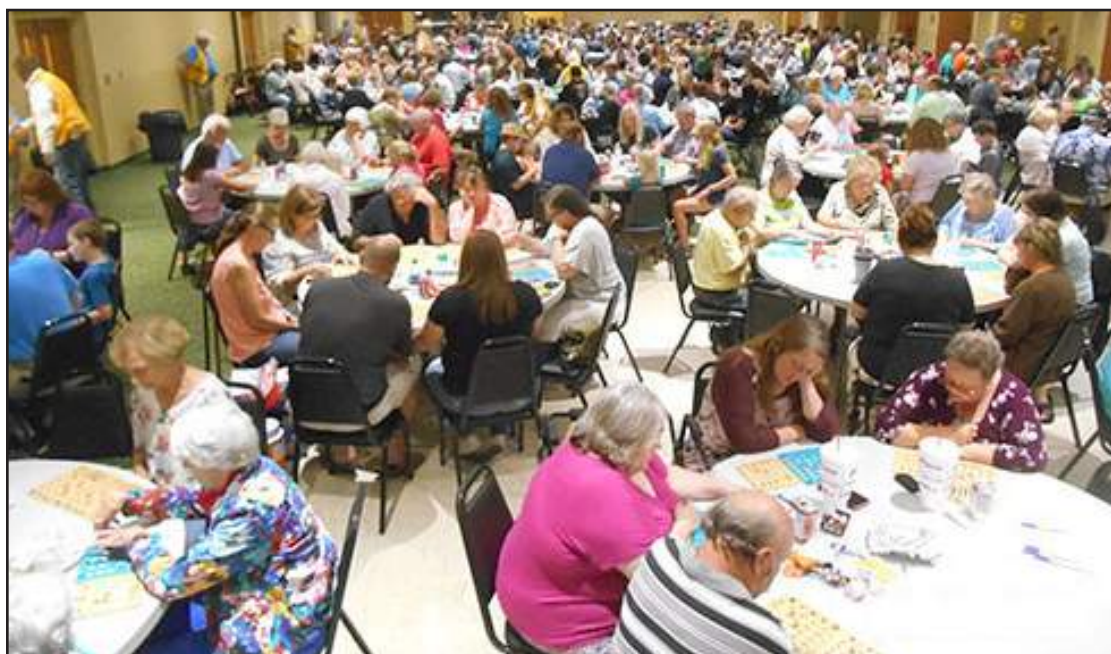
500 people attend the Scottsboro Lions Annual Hot Dog Supper & Free Bingo.

Thank you so much for your encouragement and hard work. Hope to see each of you at the District Cabinet meeting on October 12, 2019.