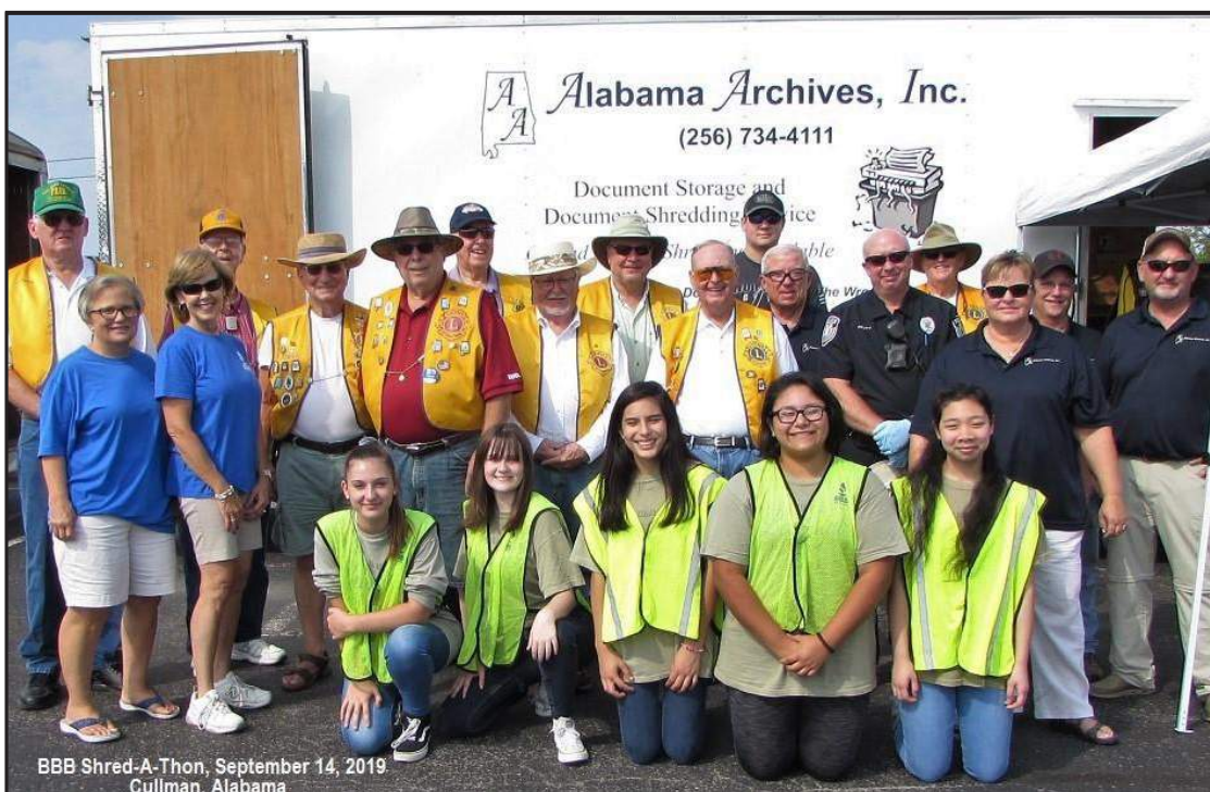
BBB Shred-A-Thon, September 14, 2019 Cullman, Alabama