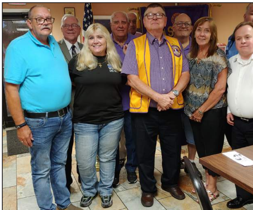
Talladega Lions Club

Lions across the good state of Alabama are doing just that. Just a few of the recent club visits, I have had the good fortune to visit, are included on this page. Opelika Lions Club, Atmore Lions Club, and the Talladega Lions Club are only three examples of Lions who are active in life. The generous donations that these and all Lions Clubs throughout the state make it possible for Alabama Lions Sight (ALS), to be "Knights of the Blind." While space doesn't allow me to include all the clubs and their activities, I want to give special recognition to these three. Opelika Lions Club yearly financial contributions to ALS and involvement in local vision screenings help Lions provide vision care to the indigent people of Alabama. The Atmore Lions Club leaned on the tremendous success of the Mobile Eye Clinic (MEC) at the